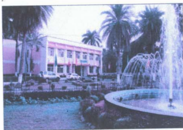
Fig.2: Administrative Building