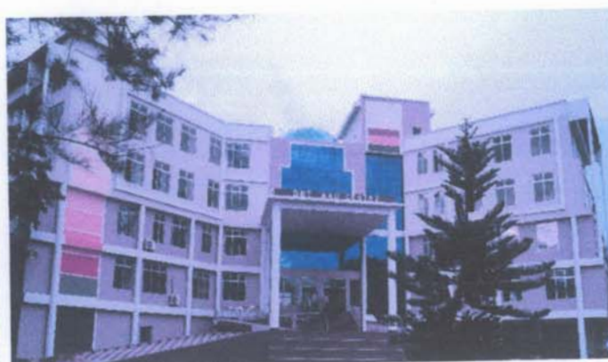
Fig.3: DBT-AAU Centre